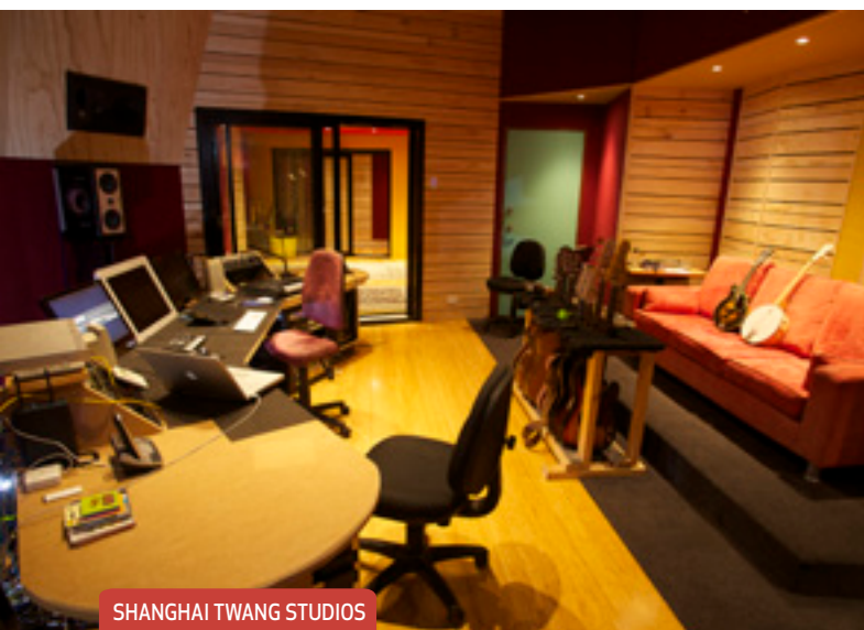
SHANGHAI TWANG STUDIOS